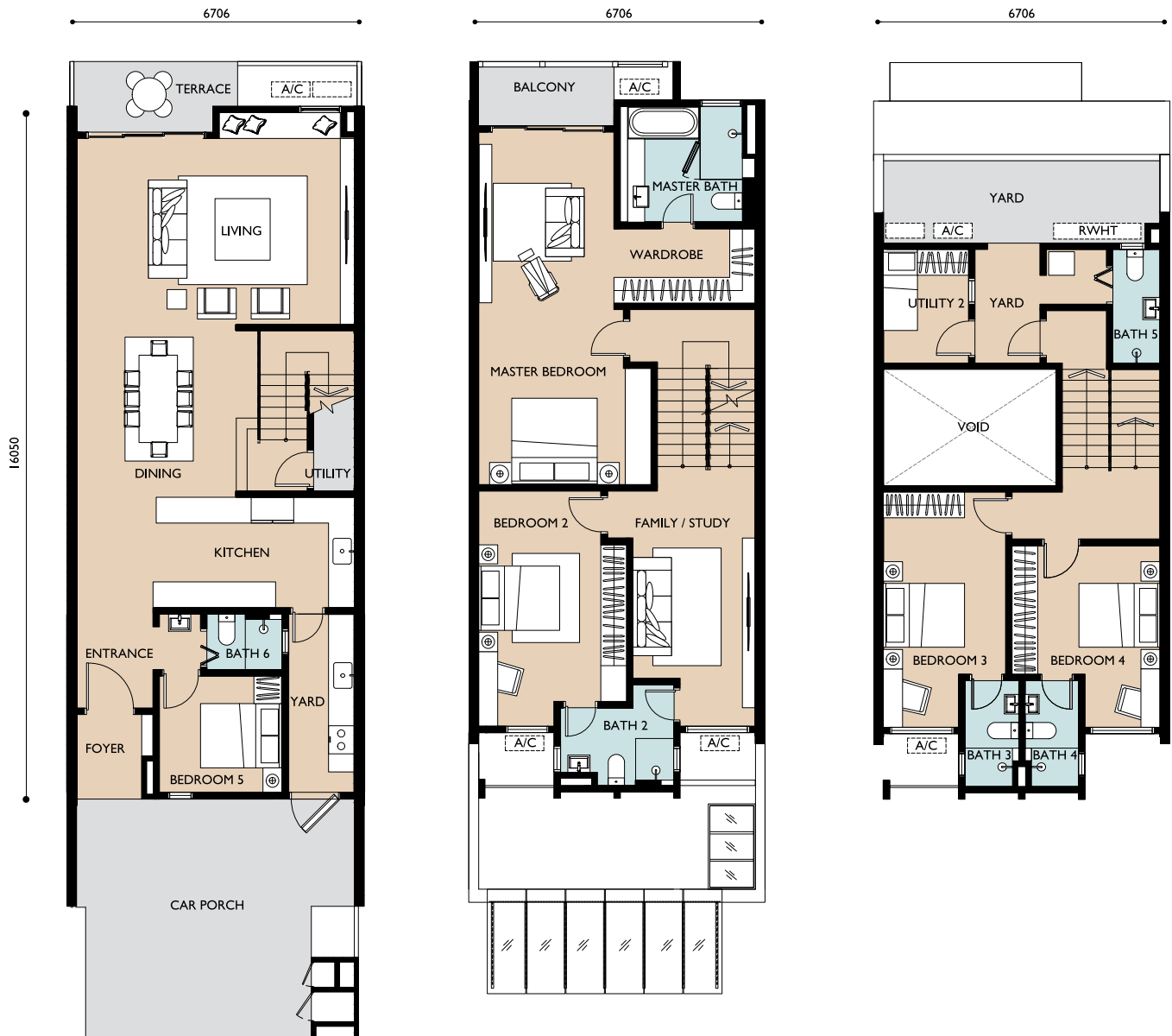
Ground Floor 底楼