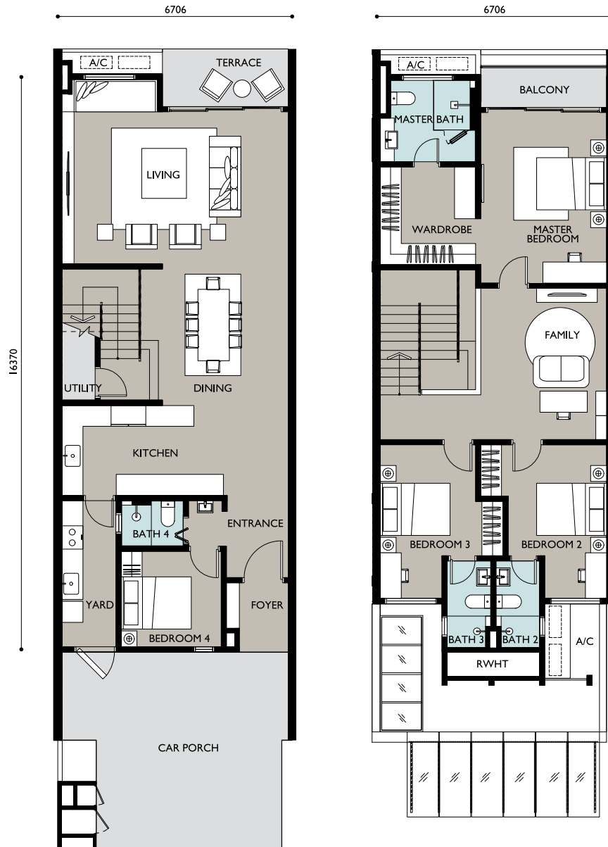
Ground Floor 底楼